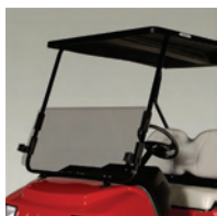
Split Windshield and Canopy