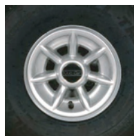
Sport Wheel Covers