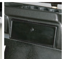
Locking Glove Box

An IR Ingersoll Rand business PO BOX 204658 • AUGUSTA, GA 30917-4658 Phone 1-800-Club Car/1-706-863-3000 • www.clubcar.com